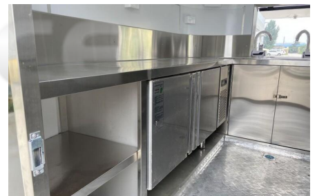
- Fridge -