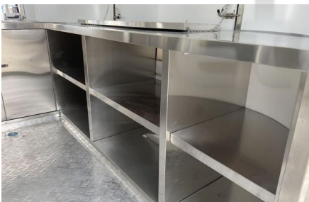
- Storage -