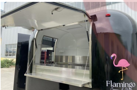
- Window -