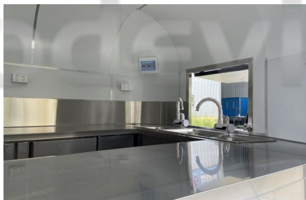
- Inside -