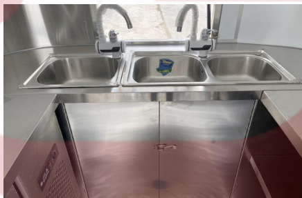
- Sinks -