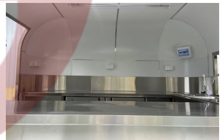
- Inside -