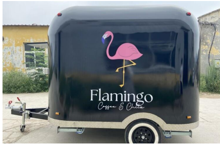
- LOGO Wrap -